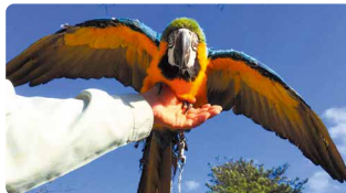
Macaw (free flight performance)