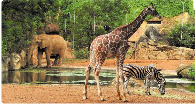
African elephant, Giraffe, Zebra

African Animal Park, which mimics African grassland and landscapes, is home to about 8 species of African animals including giraffes, African elephants, hippopotamus, rhinoceros, Abyssinian colobus, and flamingos. Visitors can observe animals in an environment that closely resembles their natural habitat.