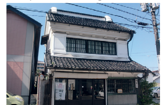
Yokoyama Miso & Soy Sauce Store: Designated October 2002