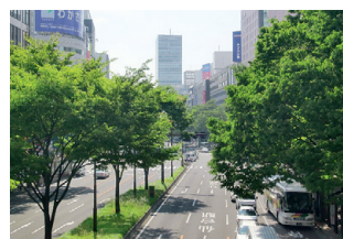
Aoba-dori Avenue District