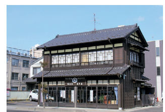
Shojiya Soy Sauce Store: Designated February 2019