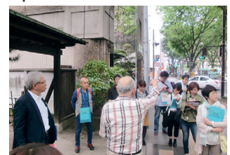
Aoba-dori Avenue Development Council