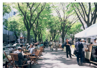
Jozenji-dori Avenue Development Council