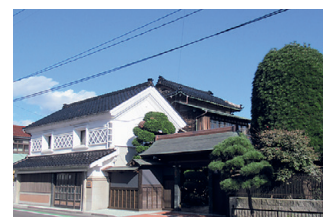
Former Hariso Inn : Designated in December 2017