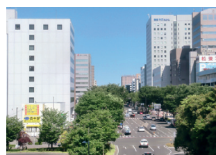
Miyagino-dori Avenue District