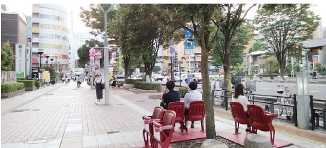
Miyagino-dori Avenue District

e.g. Miyagino-dori Avenue District, Jozenji-dori Avenue District, Aoba-dori Avenue District