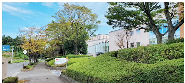
Izumi Park Town Science Park District

e.g. Izumi Park Town Science Park District, Sendai Tobu Distribution Park