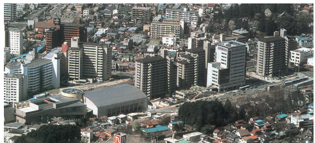
Kita-Sendai Eki Daiichi District

e.g. Chuo 1-chome District, Kita-Sendai Eki Daiichi District, Nagamachi 7-chome Nishi District