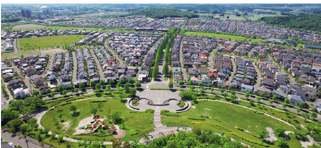
Izumi Park Town Murasakiyama District

e.g. Izumi Park Town Murasakiyama District, Senseki District, Izumi Village District