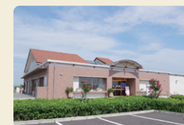
Kaigan Park Center House

General Information facility of Kaigan Park In addition to changing rooms, shower rooms and rental bicycles, this facility has halls that can be used for conducting training seminars.