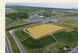
Arahama Public Square & Evacuation Hill

Public square for everyone Space containing parking lots and public toilets that also includes an evacuation hill, which serves as a place of refuge during a tsunami.