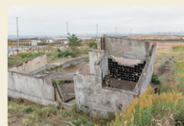
Ruins of the Great East Japan Earthquake Residential Foundation, Arahama Area of Sendai City

A facility that preserves housing foundations damaged by the tsunami. This facility shows the force of the tsunami and the daily life of residents before the disaster.