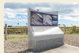
Monument 'The Memories and History of the Arahama Area'

A monument to pass down the memories and history of the Arahama area, which was devastated by the 2011 tsunami