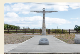
Monument 'Arahama Memorial Bell'

A monument built with the purpose of remembering Arahama and victims of the disaster