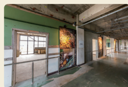
Ruins of the Great East Japan Earthquake Sendai Arahama Elementary School

Former elementary school building where 320 lives including that of children and local residents were saved from the tsunami that was triggered by the Great East Japan Earthquake. The facility is opened to the public to disseminate lessons learned from the disaster and memories of the local community.